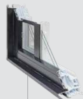
Sliding 5 3/4" HYBRID frame Contemporary sash