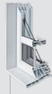
Hung 6 9/16" PVC frame Single opening