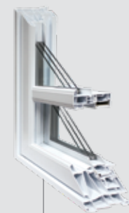
Hung 4 1/2" PVC frame Double opening