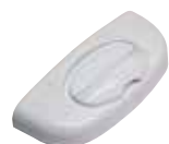
Automatic closing lock